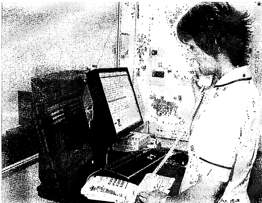
Revalidation may be linked to KSF and appraisals, says the HPC.