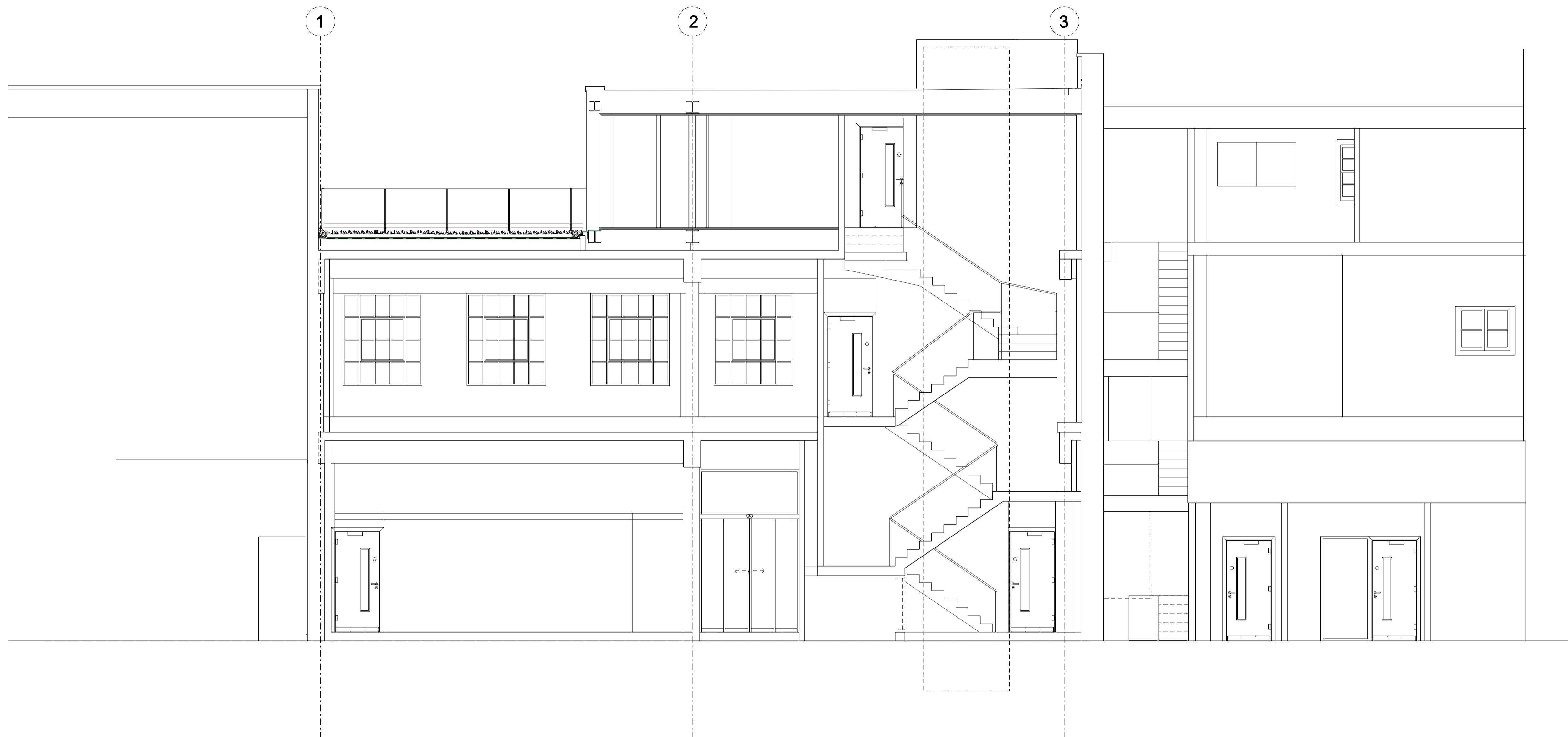
Detail 01 Section GG proposed (Option with Stair)